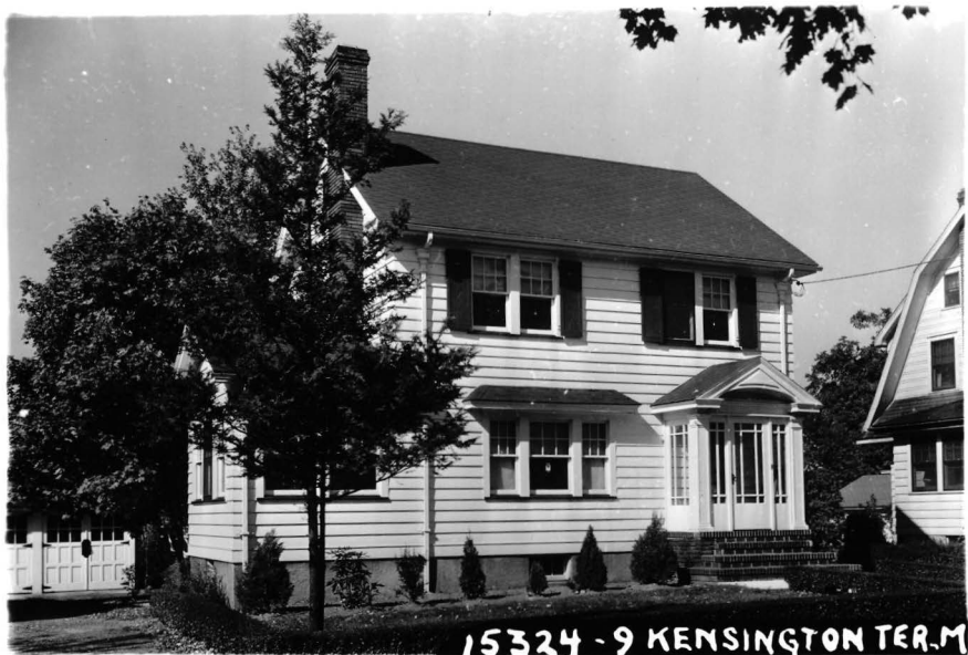
Board of Realtors of the Oranges and Maplewood.